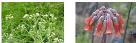
© State of Queensland 2014 Department of Natural Resources and Mines

A relevant person MUST take all reasonable steps to ensure that, in carrying out authorised activities, the person does not spread the reproductive material of a declared pest.