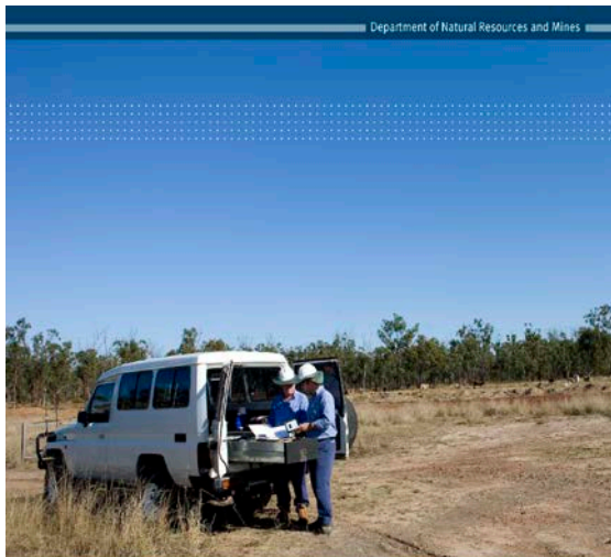
Coal Seam Gas Engagement and Compliance Plan 2013