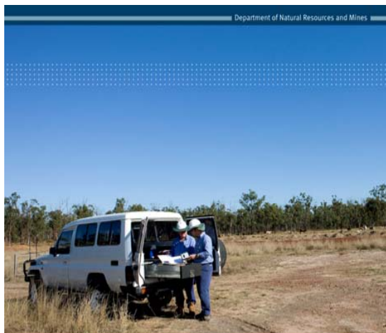
Coal Seam Gas Engagement and Compliance Plan 2013